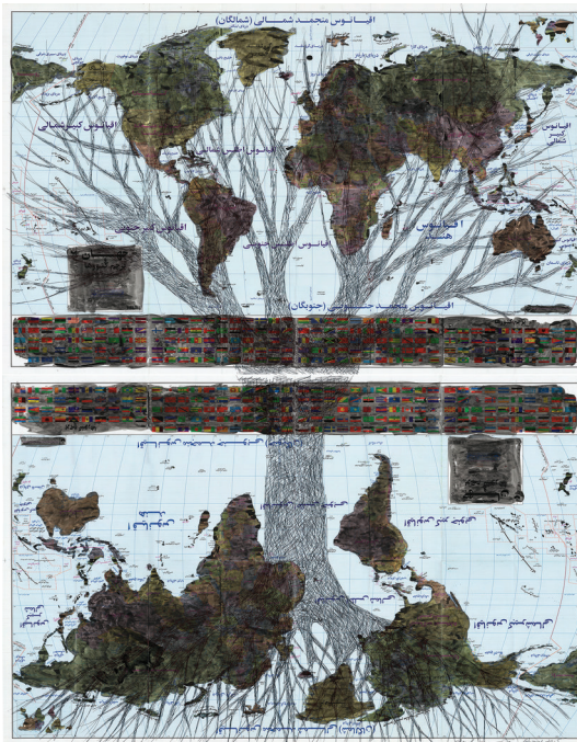
Ghazel, Dyslexia , 2015-17, acrylic and ballpoint pen on printed Iranian maps of the world, dimensions variable.