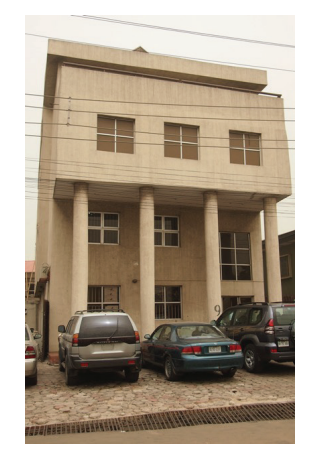
Front facade of Center for Contemporary Art, Lagos.