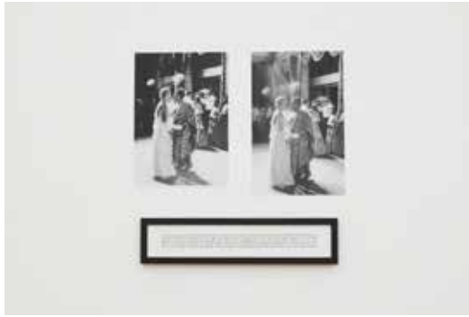
Maryam Jafri, Getty vs. Ghana , 2012, two black and white prints and one framed text, 14.37 x 9.68 in. (right) and 13.29 x 9.72 in. (left).