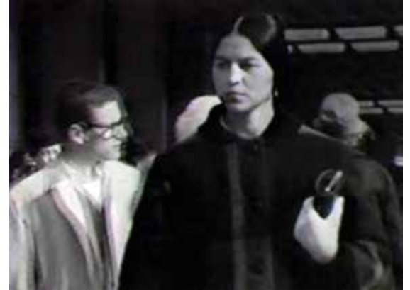
Krista Belle Stewart, Seraphine , Seraphine , 2015, digital video and sound, 38:57 min.

During the last two decades, visual artists have revitalized documentary practices, facilitated by new media technologies and modes of circulation. Documentary approaches help us bear witness to both individual and collective realities, often using found footage, biographical narratives, textual documents, and historic reenactments.