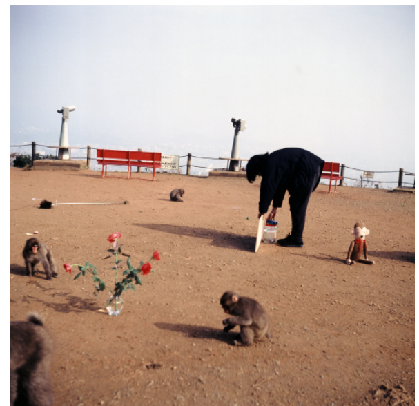
Shimabuku, Gift: Exhibition for the Monkeys, Iwatayama, Kyoto, 1992 , Cibachrome mounted on aluminum and text, 30 x 30 inches (77 x 77 cm)