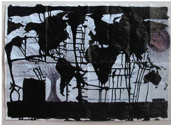
Ghazel, Marée Noire , 2015-17, acrylic and ink on paper map, 70 x 100 in., courtesy of the artist and Carbon 12, Dubai

For further information, contact Houda Lazrak at hlazrak@iscp-nyc.org