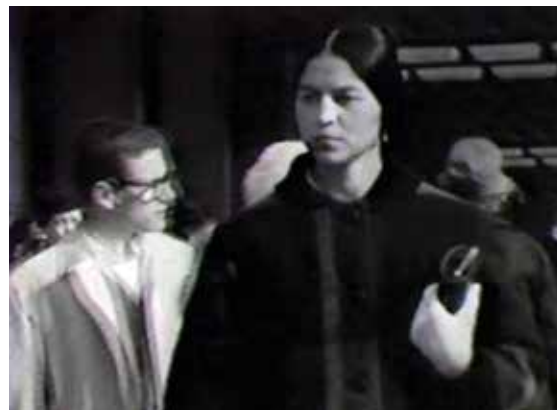
Krista Belle Stewart, Seraphine , Seraphine , 2015, digital video and sound, 38:57 min.

During the last two decades, visual artists have revitalized documentary practices, facilitated by new media technologies and modes of circulation. Documentary approaches help us bear witness to both individual and collective realities, often using found footage, biographical narratives, textual documents, and historic reenactments.