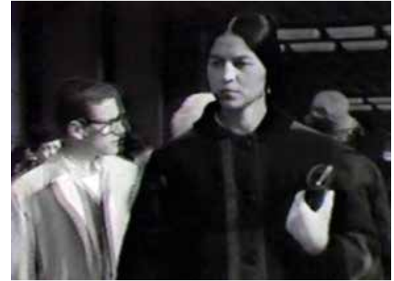
Krista Belle Stewart, Seraphine, Seraphine, 2015, digital video and sound, 38:57 min.

During the last two decades, visual artists have revitalized documentary practices, facilitated by new media technologies and modes of circulation. Documentary approaches help us bear witness to both individual and collective realities, often using found footage, biographical narratives, textual documents, and historic reenactments.