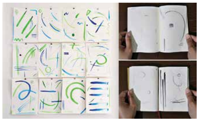
Sonia Louise Davis, duet blue + green, grid (left); black solo, journal (right), 2015 (left), 2016 (right), liquid watercolor on cold press paper (left); liquid watercolor in soft bound notebook (right), 11 x 15 in. each (27.94 x 38.1 cm) and 144 pages.