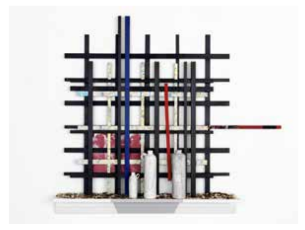
Remy Jungerman, Transition Obeach , 2013, mixed media, 51 1/8 \times 61 \times 57/8 in. (129.79 \times 154.94 \times 14.99 cm).

On May 8, Haim Steinbach and Remy Jungerman will consider the recontextualization of existing objects, and the cultural meanings of display.