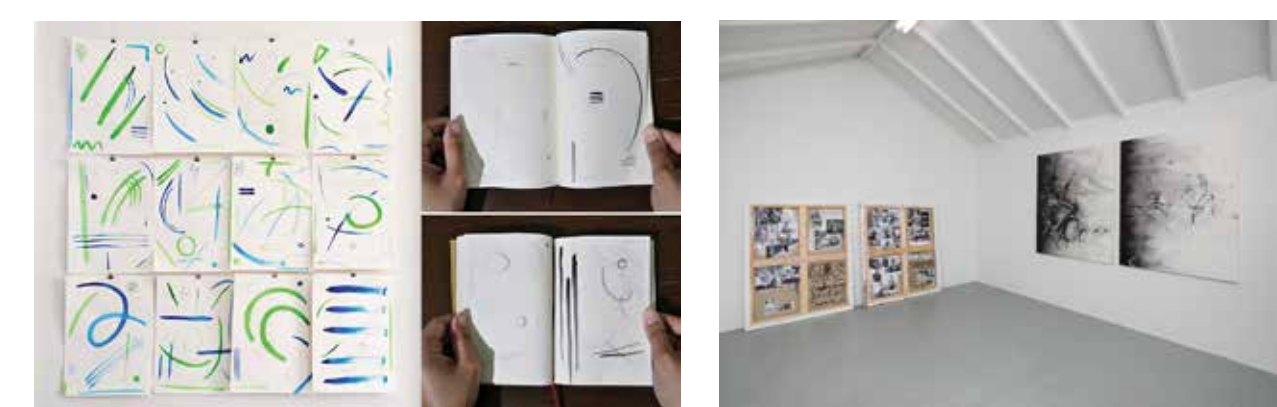
Sonia Louise Davis, duet blue + green, grid (left); black solo, journal (right), 2015 (left), 2016 (right), liquid watercolor on cold press paper (left); liquid watercolor in soft bound notebook (right), 11 x 15 in. each (27.94 x 38.1 cm) and 144 pages.