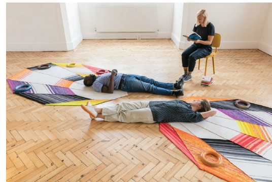
Jennifer Tee, Let It Come Down , 2017.

The International Studio & Curatorial Program announces Ether Plane~Material Plane , an exhibition by Jennifer Tee, a 2012 ISCP alumna. The artist's first solo exhibition on this continent, Ether Plane~Material Plane responds to current political upheaval and ensuing resistance.