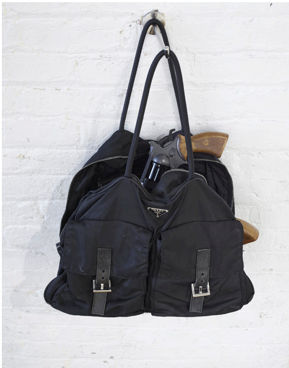
Chiara Fumai, Prada Bag with Guns and Balaclavas , 2016, bag, fabric and plastic, 21 × 16 × 9 in. (50 × 22 × 26 cm).