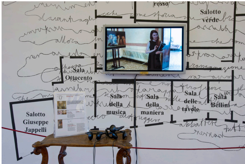
Chiara Fumai, Der Hexenhammer (detail), Museion Project Room, 2015.