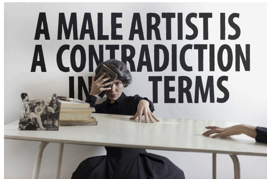
Chiara Fumai, Annie Jones reads Valerie Solanas , 2013, C-print, 31 ½ × 47 ¼ in. (80 × 120 cm).