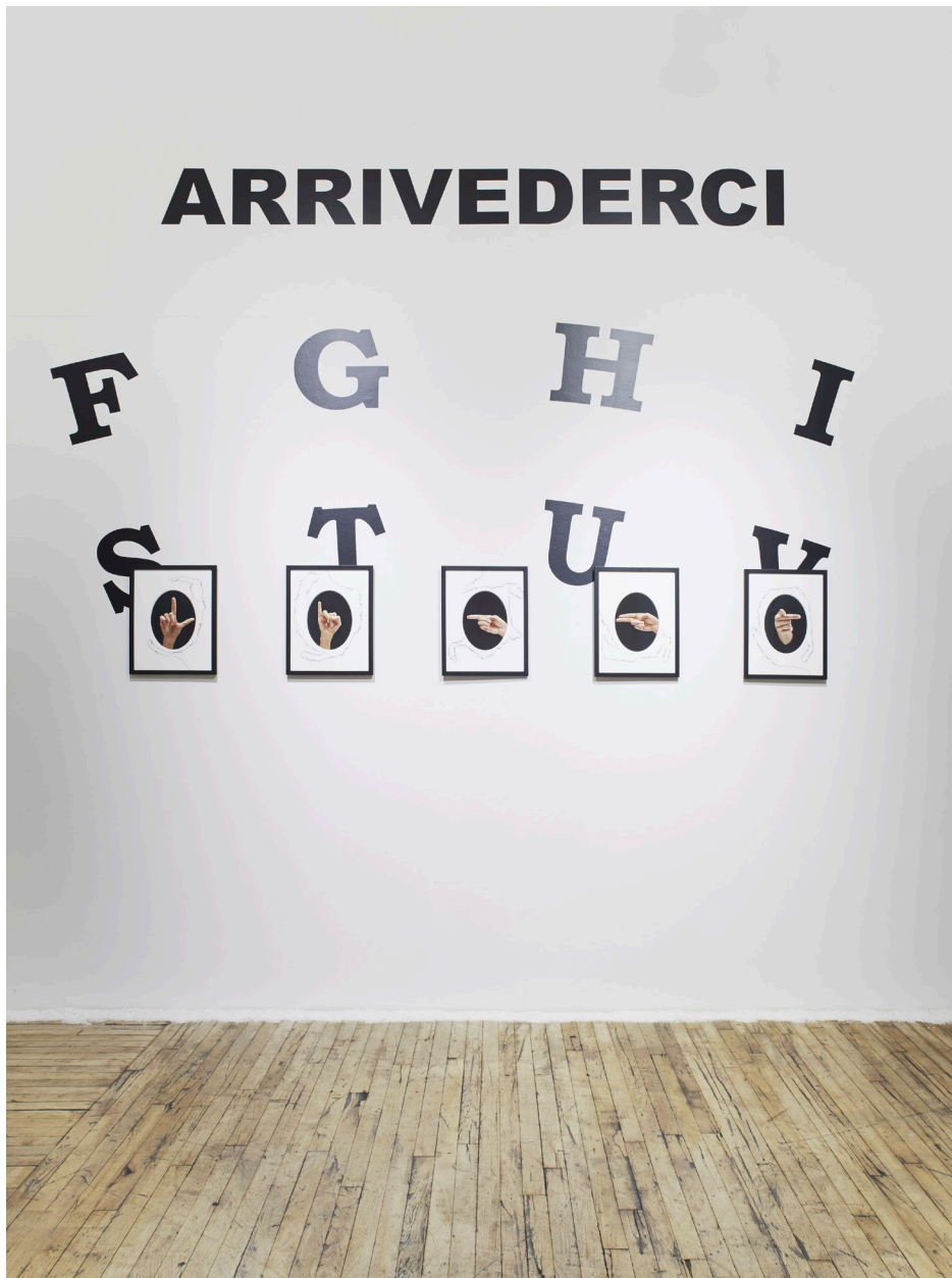
Installation view of Chiara Fumai: LESS LIGHT , 2019.