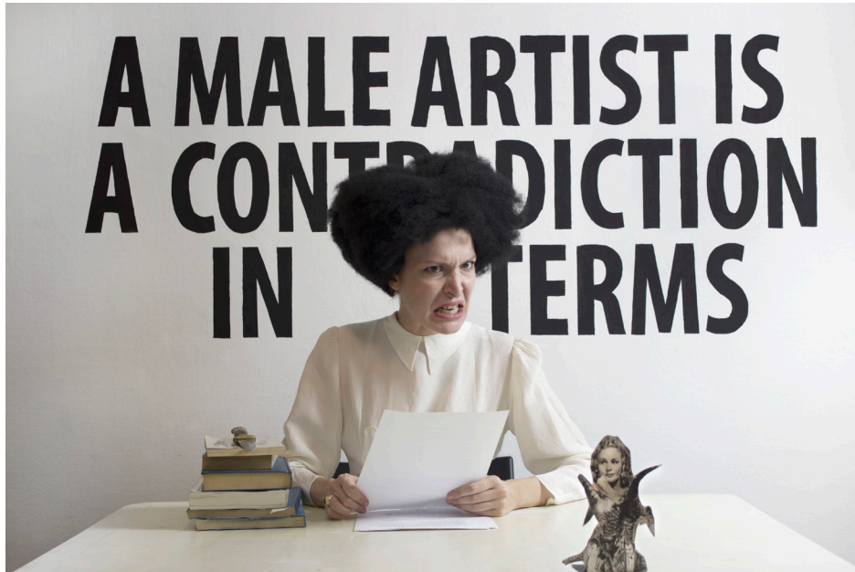
Chiara Fumai, Harry Houdini reads Valerie Solanas , 2013, C-print, 31 ½ × 47 ¼ in. (80 × 120 cm).