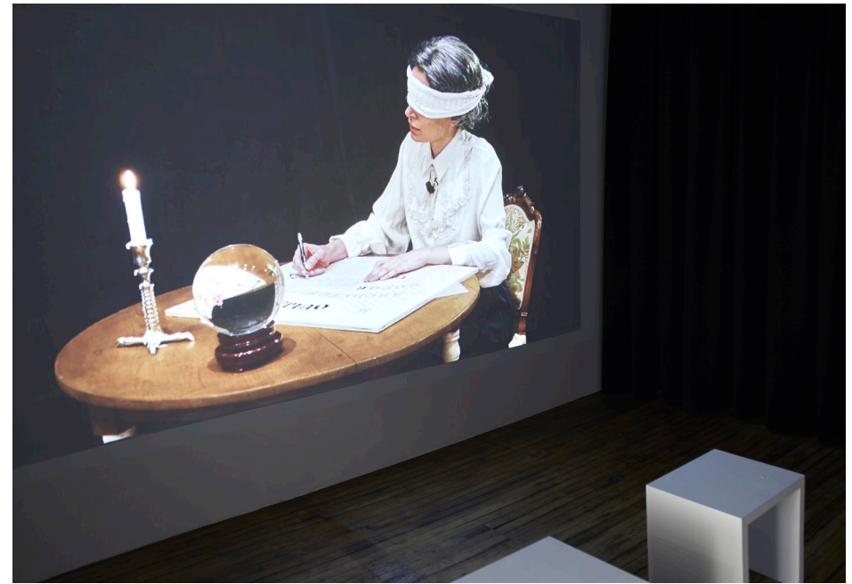
Chiara Fumai, The Book of Evil Spirits , 2015, single channel color video, 26 min. 25 sec.

FUR Your collages function as scripts in automatic writing, your photographs set the iconography of the characters you play, your installations and objects are the continuation of your performances by other means. Apparently, there's no place for proper documentation in your artistic practice. Why?