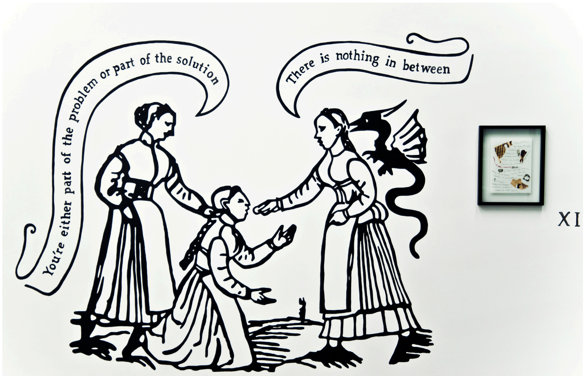
Chiara Fumai, I Did Not Say or Mean 'Warning' (detail), 2013, wall drawing, performance document, text by Anonymous Woman, 78 × 131 in. (200 × 332 cm)