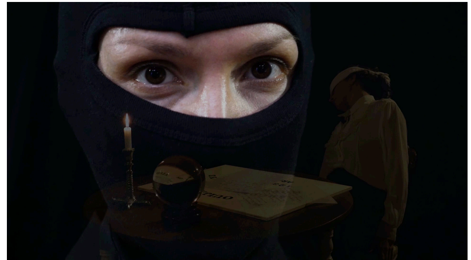
Chiara Fumai, The Book of Evil Spirits , 2015, single channel color video, 26 min. 25 sec.

Chiara Fumai: LESS LIGHT was organized in collaboration with The Church of Chiara Fumai, and supported by grants from Greenwich Collection Ltd.; Hartfield Foundation; and the New York City Department of Cultural Affairs, in partnership with the City Council. This project was also funded by the New York State Council on the Arts with the support of Governor Andrew M. Cuomo and the New York State Legislature; Stavros Niarchos Foundation (SNF); The Andy Warhol Foundation for the Visual Arts; and The Italian Academy for Advanced Studies, Columbia University. To all of these generous supporters, I express my heartfelt appreciation for entrusting us to produce excellent programming that focuses on underrecognized and underrepresented artists in this cultural metropolis.