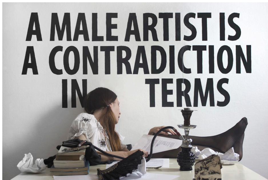
Chiara Fumai, Dogaressa Elisabetta Querini reads Valerie Solanas , 2013, C-print, 31 ½ × 47 ¼ in. (80 × 120 cm).