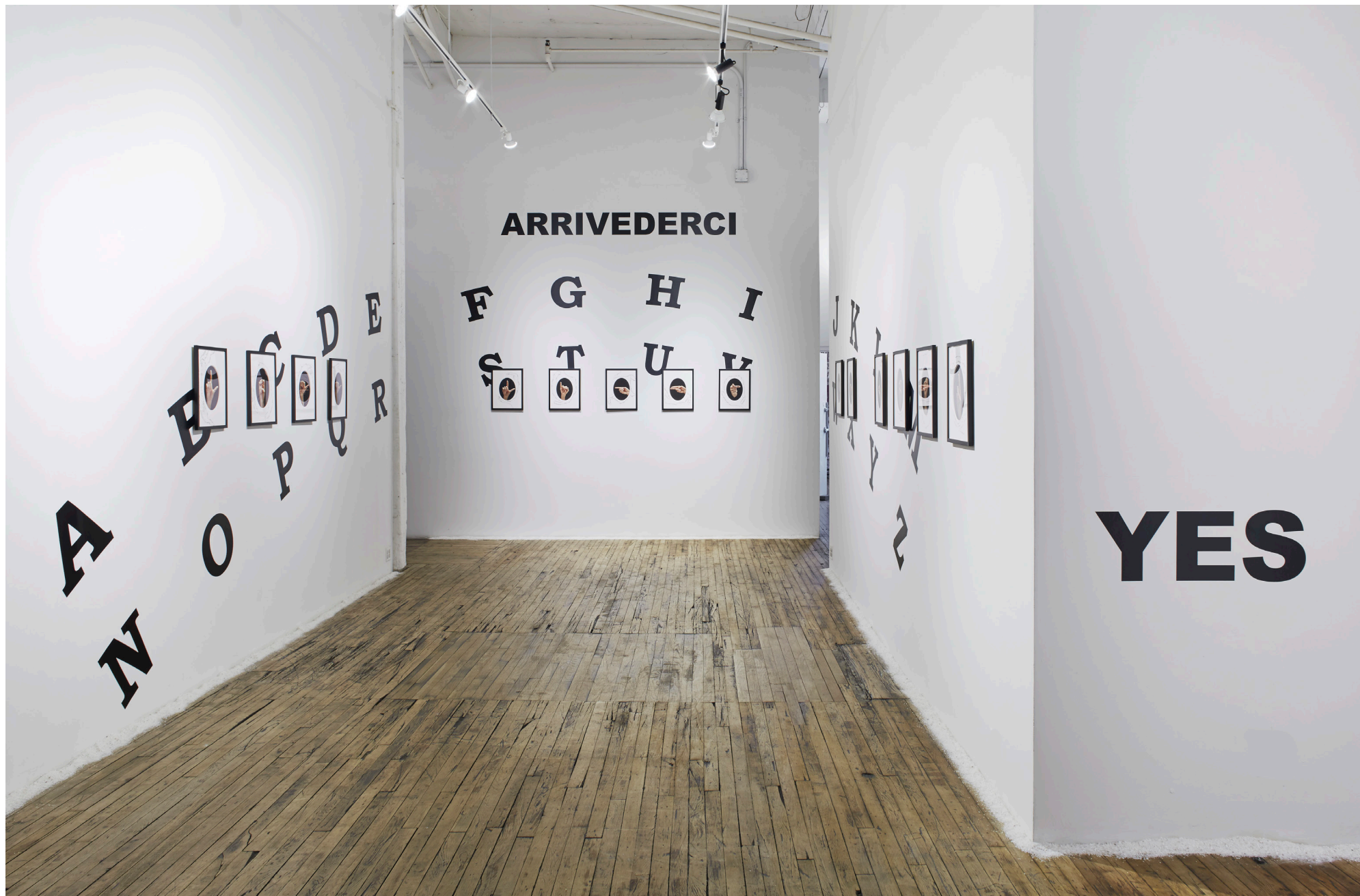
Installation view of Chiara Fumai: LESS LIGHT , 2019.