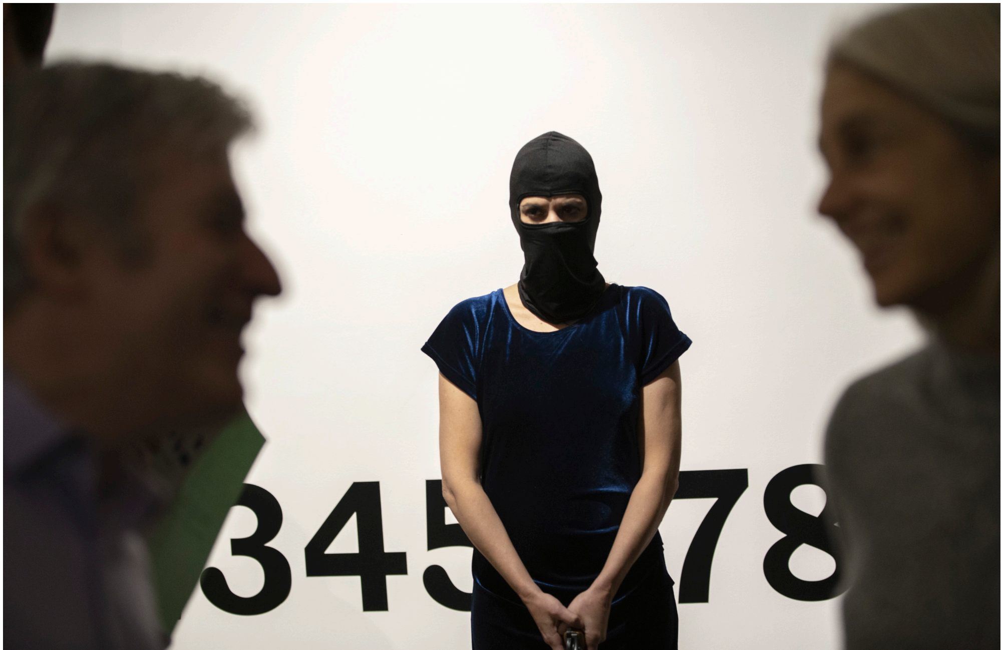
The S.C.U.M. Elite , 2019, as performed in the exhibition Chiara Fumai: LESS LIGHT .