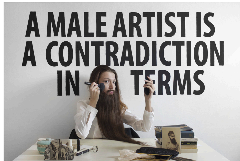
Chiara Fumai, Dope Head reads Valerie Solanas , 2013, C-print, 31 ½ × 47 ¼ in. (80 × 120 cm).