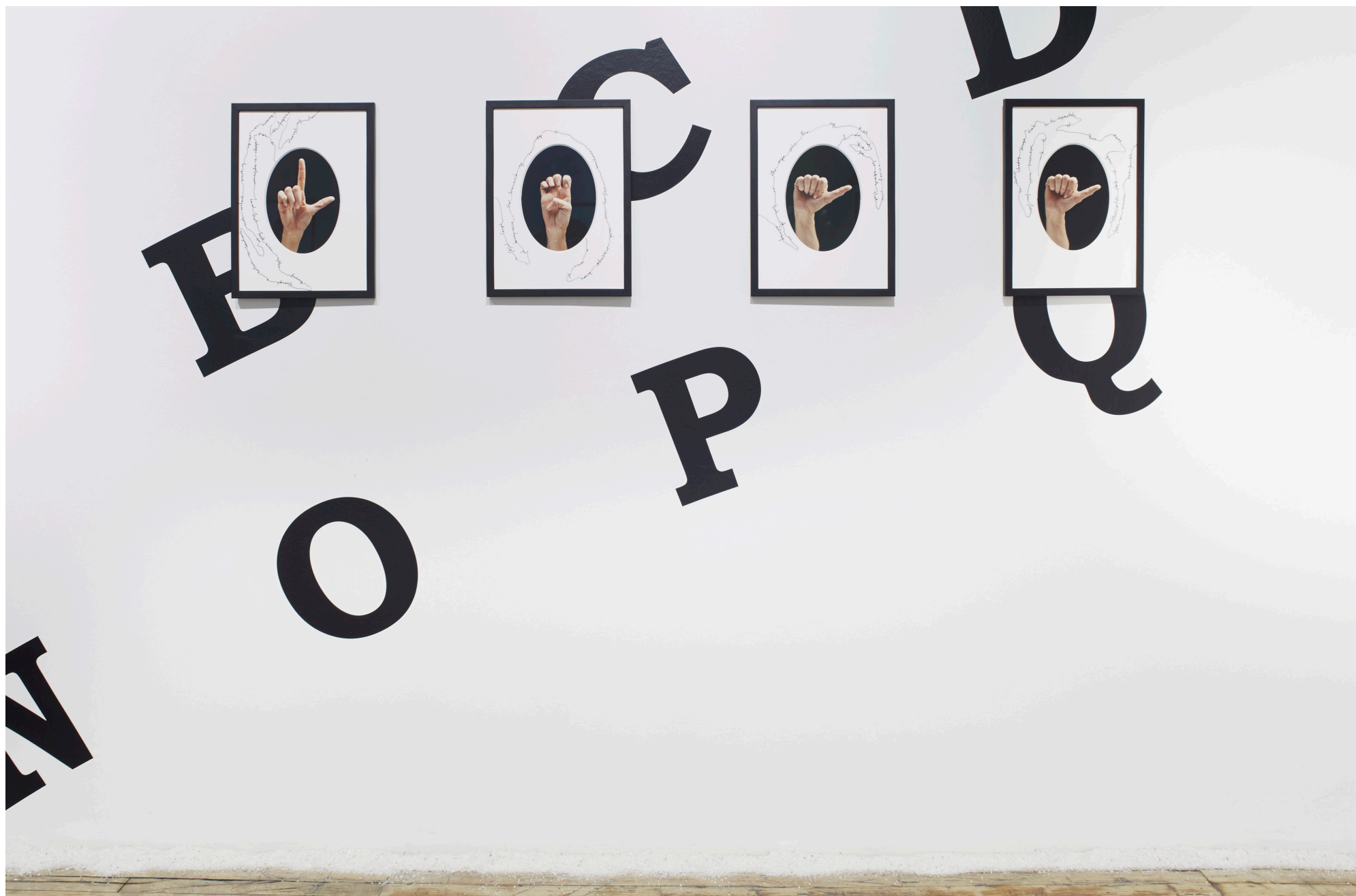
Installation view of Chiara Fumai: LESS LIGHT , 2019.