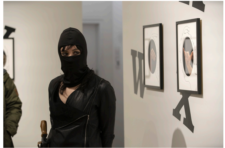
The S.C.U.M. Elite , 2019, as performed in the exhibition Chiara Fumai: LESS LIGHT .

"Less Light, My Dear" ( Mio caro, mena luce )—from which the title of this exhibition is taken—is a line uttered by Fumai in the video and excerpted from Flammarion's numerous reports of Palladino requesting less light at her séances: she often asked the attendees to turn down the gas lamps. Through performance, writing, and text-based installations, language permeated Fumai's practice as a way of addressing struggle, knowledge, and power. "Less Light, My Dear" is also the phrase spelled out in the fifteen photographs installed on top of the Ouija board in-the-round. Each letter of "Less Light, My Dear" is spelled out in Italian Sign Language, with the resulting photographs framed in an oval matte and surrounded by automatic drawing created by Fumai of lines from Flammarion's book, with some letters drawn in reverse.