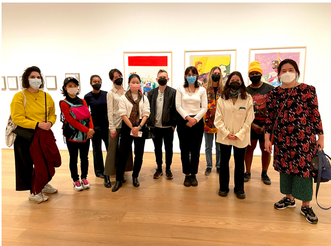
Resident Field Trip to The Drawing Center. March 2022.