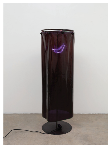
Ajay Kurian, Bather , 2018, vinyl, grommets, curtain hooks, LEDs, steel, 64 × 20 × 20 in. (162.56 × 50.80 × 50.80 cm).

The International Studio & Curatorial Program announces the group exhibition Water Works , curated by Danielle Wu.