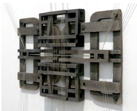
Vibe Overgaard, Spindle City , 2023, ceramics, thread, metal bolts and reclaimed lumber, 15 × 10 × 3 in.

The International Studio & Curatorial Program presents Spindle City , a solo exhibition of work by Vibe Overgaard, curated by Media Farzin. Spindle City takes the textile industry as a context from which to examine the workings and impact of growth economies. It is based on the artist's research in Pawtucket, Rhode Island, and Lowell, Massachusetts, major hubs of industrial cotton production in the United States, and draws on the artist's background growing up in a Danish town founded as a manufacturing center for textiles.